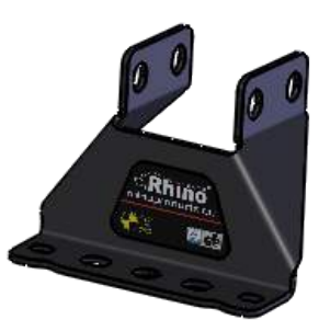
MS283 x 2