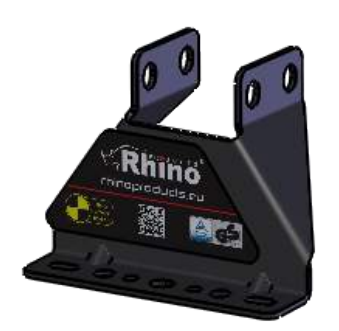
MS168 x 2