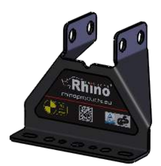
MS1001 x 2